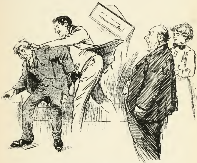
HE FELT THE LARGE AND CLUMSY HAND OF MR. BUTLER TAKE HIM BY THE COLLAR

Mr. Culpepper grasp Mr. Butler by the hand. More 'dazed still, he felt the large and clumsy hand of Mr. Butler take him by the collar and propel him with some violence along the small passage, while another hand, which he dimly recognized as belonging to Mr. Culpepper, was inserted in the small of his back. Then the front door opened and he was thrust out into the night. The door closed, and a low feminine laugh sounded from a window above.